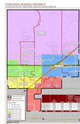
Conceptual Scenario B